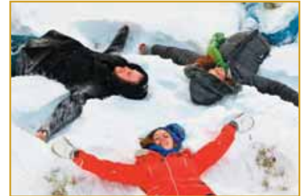
The RMC campus is lovely after a fresh snow. Students couldn't wait to take advantage of the winter wonderland.

1511 Polly Dr - Billings, MT 59102 OFFICE OF ADMISSIONS