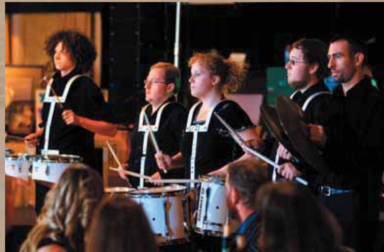
RMC's Drumline performed, setting a spirited tone for the evening's festivities.