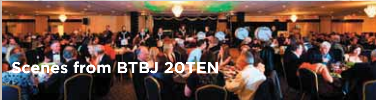
Scenes from BTBJ 20TEN

That’s what I see happening here. We have so much to be grateful for and I am privileged and honored to be in a prime place to see it, to feel it, and to share it.