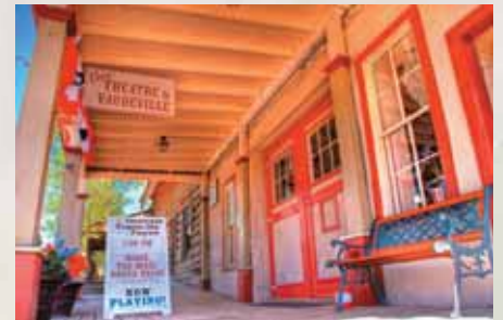
Rocky Mountain College has assumed management of the historic Virginia City Opera House.