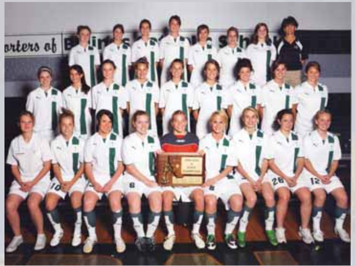
The Billings Central Girls Soccer Team, this year's Class A State Champions, made RMC's Campus Beautification program their civic project.