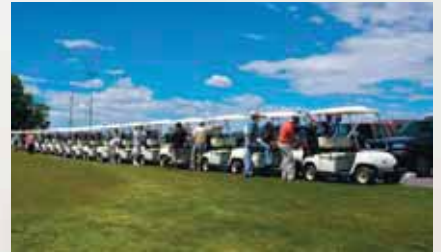
A long line of carts awaited alumni for last year's annual RMC Alumni Association Golf Scramble.